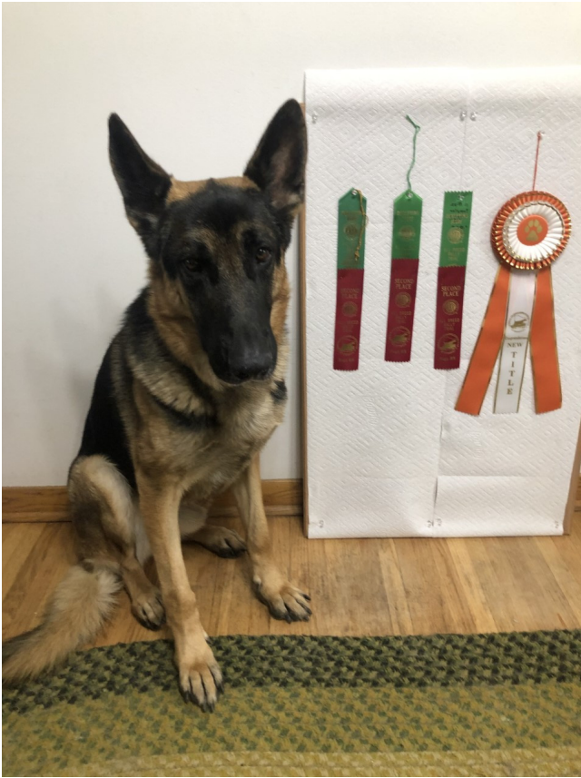
Templar's rally weekend, 1-88 , 1-78, 1-96 , resulted in his advance "A" title at short hair pointer tria