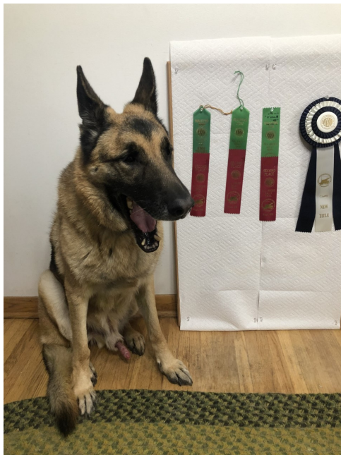
Gaetho's rally novice, 2-100 &1-99 ; 1 new title