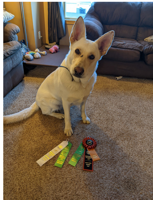
We had a great time at the NRC Scent Work Trial this weekend. This weekend was first time we did Novice Buried and Novice Handler Discrimination. We got our First Q with a 4th Place in Novice Buried. And got our Novice Interior Title and moved up to Advanced Interior!